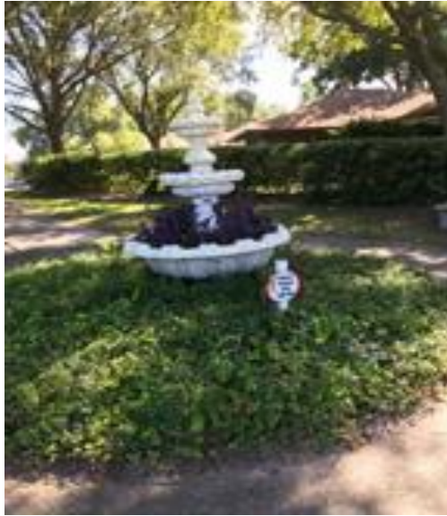
Painted fence and fountain in Park